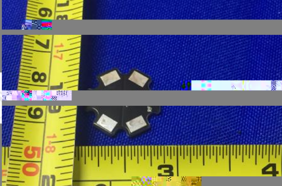
Fig. 1 - Overall view of the sample